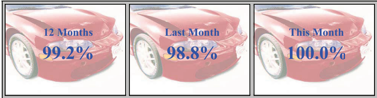
Total Customer Satisfaction for Past 12 Months